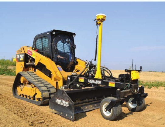
ATI Level Best PD Series Grading Box and Trimble GCS900 Grade Control System with Single GNSS