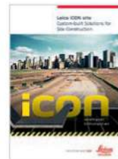
Leica iCON site Brochure