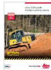
Leica iCON grade Brochure