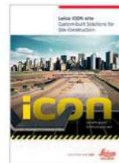
Leica iCON site Brochure