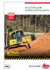
Leica iCON grade Brochure